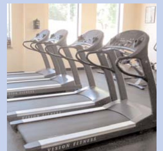
Omni Salon, Spa, & Fitness Studio